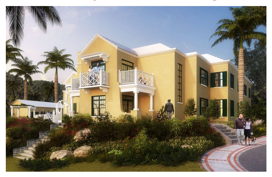
Rendition of the Ramsbury Nursing development planned for Pitts Bay Road.