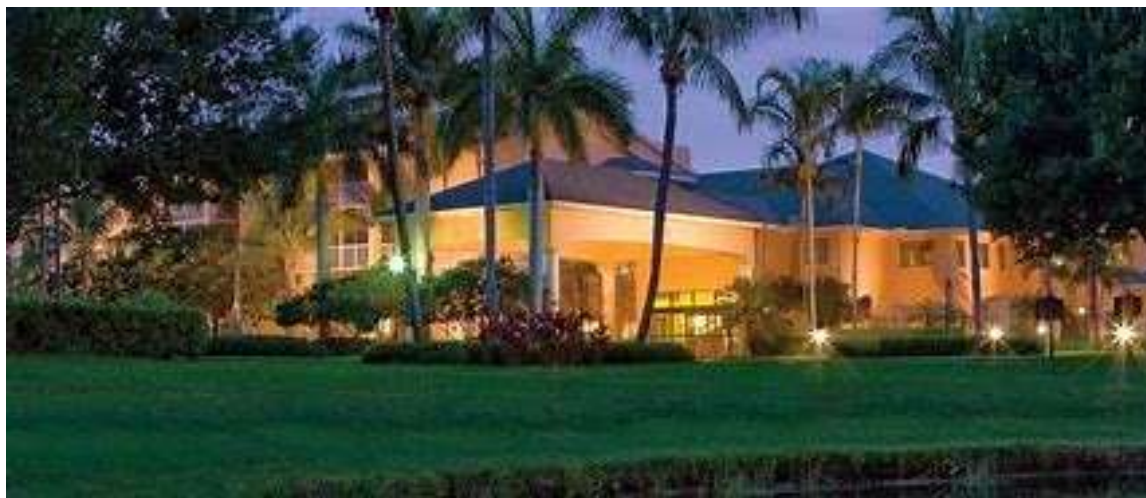
Photograph for illustration purposes and not necessarily representative of final architectural rendition.